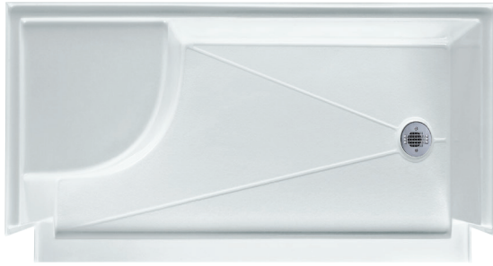
Shown above with right-hand drain.