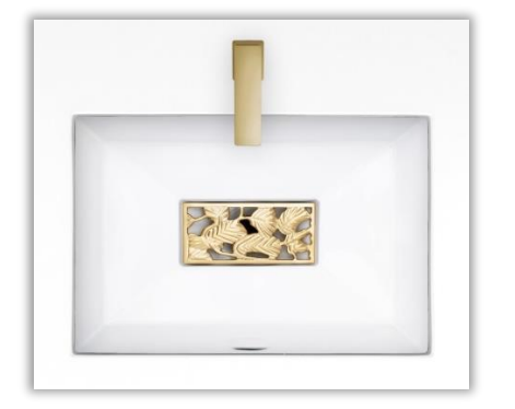
Shown with GM002 UB